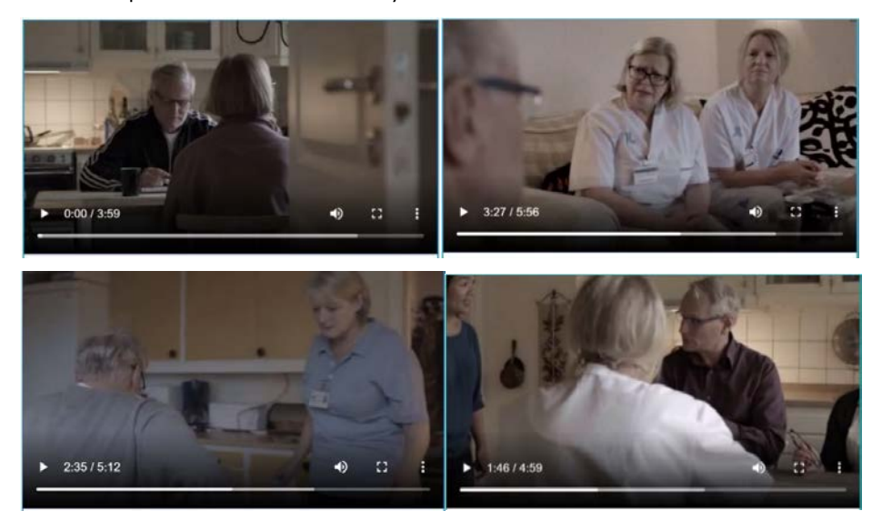
Figure 2. Screenshots from four embedded short video clips showing the patient and his wife acting in their home and the patient receiving home visits by four different healthcare professions and community-based home care

patient model had the intention to stimulate reflection-in-action in every learning cycle and reflection-on-action at the end of the session (Schön, 1983).