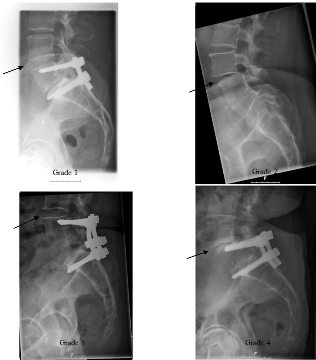
Figure 3. Radiograph illustrating from top left to bottom right, grade 1- 4 in the UCLA grading scale with normal disc (grade 1), narrowing of disc space (grade 2), osteophyte formation (grade 3) and with endplate sclerosis (grade 4). (Radiographs from patients in Paper III).