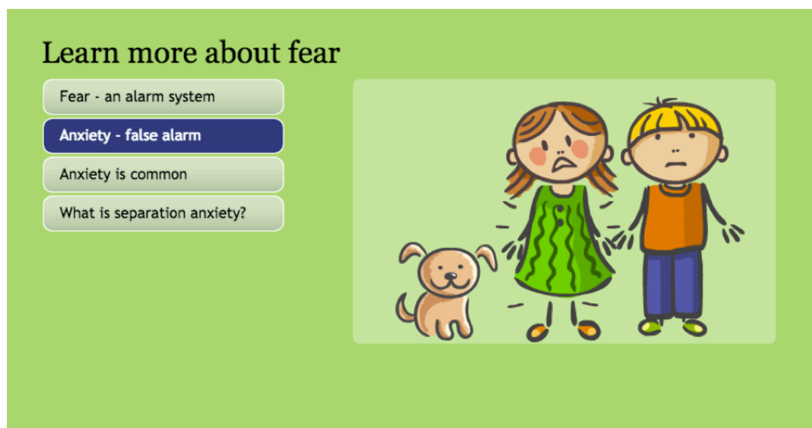
Figure 1. Animated psychoeducation for children in the ICBT program

We aimed to present treatment content in a brief and varied manner, especially for the children. Reading materials were kept short and child-directed modules contained many animations, illustrations, and exercises (see Figure 1 and 2). The psychoeducation directed to children was shorter than the parent-directed information, and adapted to an appropriate developmental level.