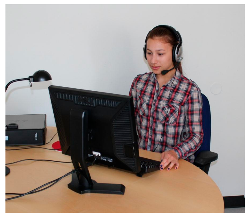
Figure 3. Student using standard PC equipment and a headset to communicate with others during a CPR scenario with avatars in the virtual world.

It was assumed that the trainees had some (moderate) computer literacy, but that their experience from virtual worlds varied, including some that might have no such experience. Therefore, before the virtual world training the trainees were familiarized to the virtual environment and basic features in OLIVE. In the studies carried out in Sweden (Huddinge High School and Karolinska Institutet) this familiarization was carried out by letting the subjects experiment how to move around with the avatar, how to communicate and by an instructor-avatar led tour of the environment. The CPR capabilities were also demonstrated. Before the training started, the trainees were encouraged to address technical and practical problems through virtual world interaction. Problems were then resolved. In order to ascertain that the trainees possessed necessary knowledge, the subjects also received a 10 minute lecture covering basic life support (BLS) including the recently modified adult CPR guidelines as well as some other emergency medical protocols (such as the algorithm for foreign body obstruction). Parts of Study II were carried out in the US (Woodside High School, CA). Familiarization for these subjects included a short demonstration of how to control the avatar followed by a warm-up scenario