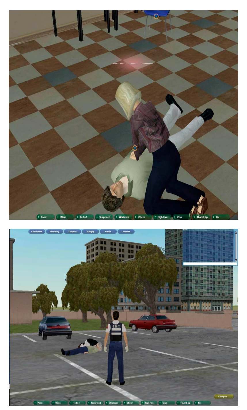
Figure 2. Avatars performing CPR in virtual world (OLIVE). a) On the top screenshot a female avatar executes chest compressions in a classroom setting. The line above her head indicates that she is talking - maybe counting as she performs the compressions.

b) The lower screenshot is from the instructor's view. Rescue breaths are administered by a trainee's avatar and a paramedic, operated by the instructor, has just arrived.