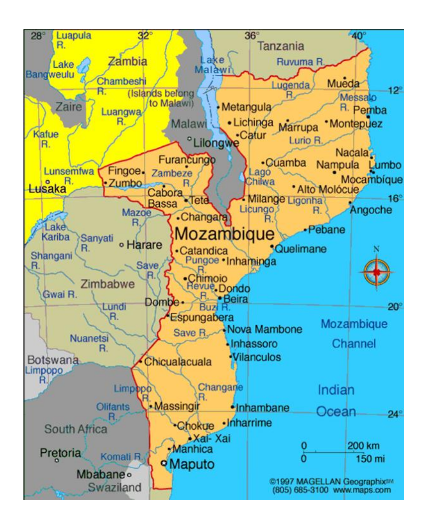
Figure 2: Map of Mozambique.

Mozambique has an estimated population of 22.416.881 million inhabitants; 47% are female (10,524,035), and 63% live in rural areas. The official language is Portuguese. Mozambique has a GDP per capita of 454 $USD, a literacy rate of 51.9%, a life expectancy at birth of 48 years, and an infant mortality rate of 124/1,000. Maputo City is the capital of the country, and has 1,178,116 million inhabitants (608,569 females). Moreover, 61.2% of the female population is composed of women of child-bearing age [146]. See Figure 2.