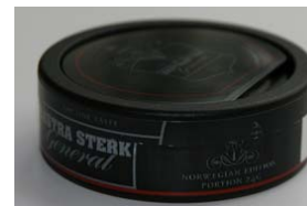
Swedish moist snuff

The major component in tobacco is nicotine, a highly addictive alkaloid. Tobacco smokers are exposed to nicotine, but also to more than 4 500 other chemicals. Major health hazards of tobacco smoke are well known, but the role of nicotine is still unclear. Users of moist snuff are exposed to similar or higher concentrations of nicotine [205]. The absorption of nicotine through the oral mucosa is slower than when tobacco is