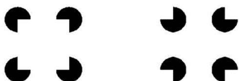
Fig. 3. Images for the visual choice reaction task. Kanizsa illusory square (left panel) and non-square (right panel).

Response time (RT) was measured simultaneously with the ERP recordings in the auditory and visual experiment, respectively. RT was recorded from the onset of the stimulus to the time for response (button press). RT data were obtained by averaging trials of auditory stimuli (to both auditory targets) and visual stimuli (to both visual targets), respectively.