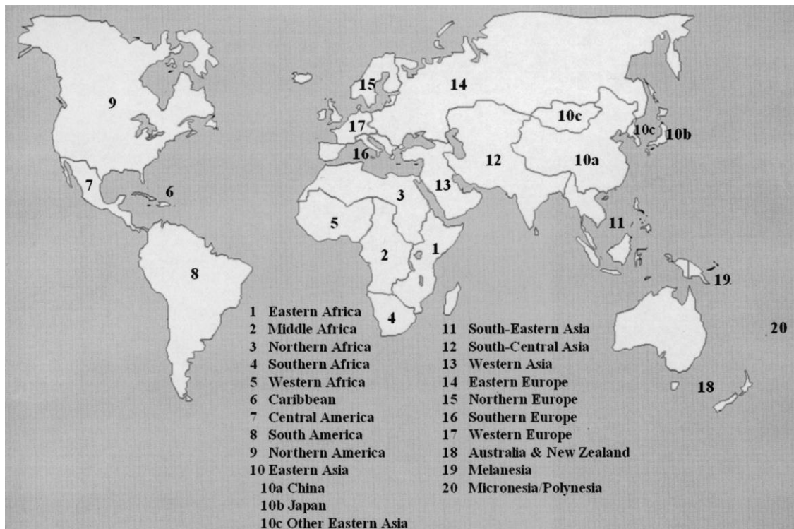
Figure 1 Map Showing the World Areas Studied in Globocan 2002. From Parkin et al (8)

Because of intercountry variations within these regions, the countries were further categorised into low-, medium- and high-risk regions for cervical cancer according to the ASRs (less than 10, 10-20 and >20 per 100 000 women, respectively). If there were more than 10 000 immigrants from a particular country, or if there were fewer but from a country with an ASR different than those of the other countries in their region, they were studied separately. For all categories of risk regions average ASRs were calculated from the country-specific ASRs provided by Globocan 2002.